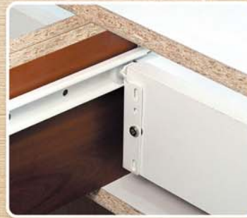
METABOX DRAWER SYSTEM