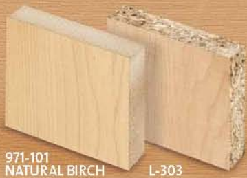
971-101 NATURAL BIRCH