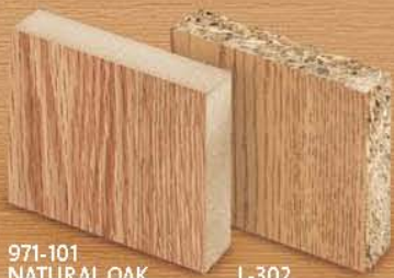
971-101 NATURAL OAK