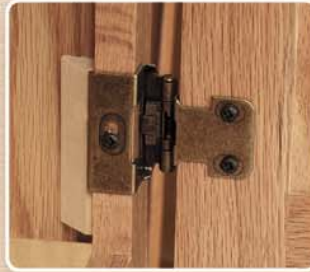
ANTIQUe BRASS HINGES