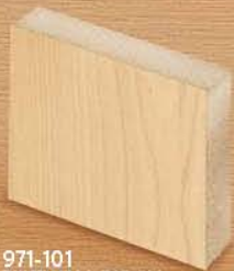
971-101 NATURAL BIRCH