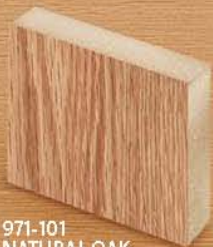
971-101 NATURAL OAK