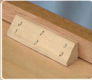
WOOD ANGLE BLOCK